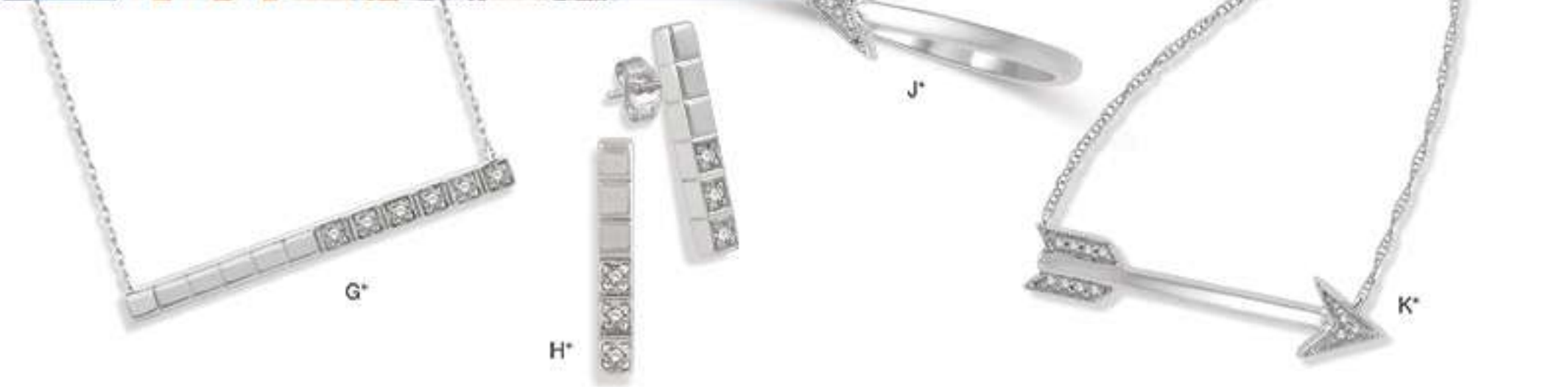
A. Circle of love pendants, 1/4 carat tw 1/2 carat tw 1 carat tw B. Smile necklaces, 1/4 carat tw 1/2 carat tw 1 carat tw C. Oval pendants, 1/4 carat tw 1/2 carat tw 1 carat tw D. Diamond inside-out hoop earrings, 1/2 carat tw 1 carat tw 1 1/2 carat tw 2 carat tw E. Pave diamond drop earrings 3/8 carat tw F. Pave diamond drop pendant 1/4 carat tw G. Diamond bar necklace H. Diamond bar earrings J. Arrow wrap diamond ring K. Arrow diamond necklace