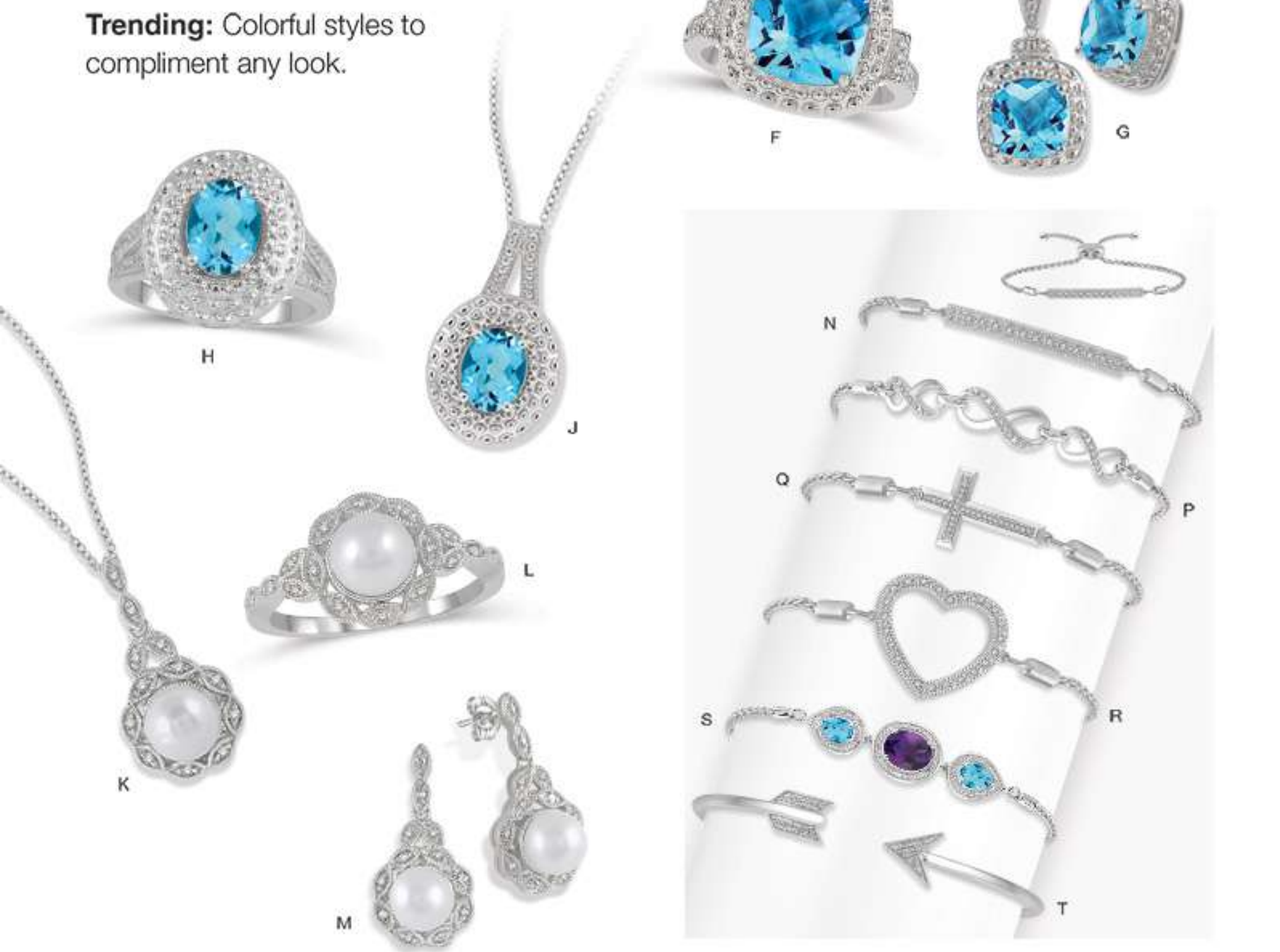
A. Amethyst and diamond pendant B. Amethyst and diamond ring C. Amethyst and diamond pendant D. Amethyst and diamond ring E. Blue topaz and diamond pendant F. Blue topaz and diamond ring G. Blue topaz and diamond earrings H. Blue topaz and diamond ring J. Blue topaz and diamond pendant K. Pearl and diamond pendant L. Pearl and diamond ring M. Pearl and diamond earrings N. Diamond bar lariat bracelet P. Diamond infinity lariat bracelet Q. Diamond cross lariat bracelet R. Diamond heart lariat bracelet S. Amethyst and Blue topaz lariat bracelet T. Diamond arrow bangle

Trending: Colorful styles to compliment any look.