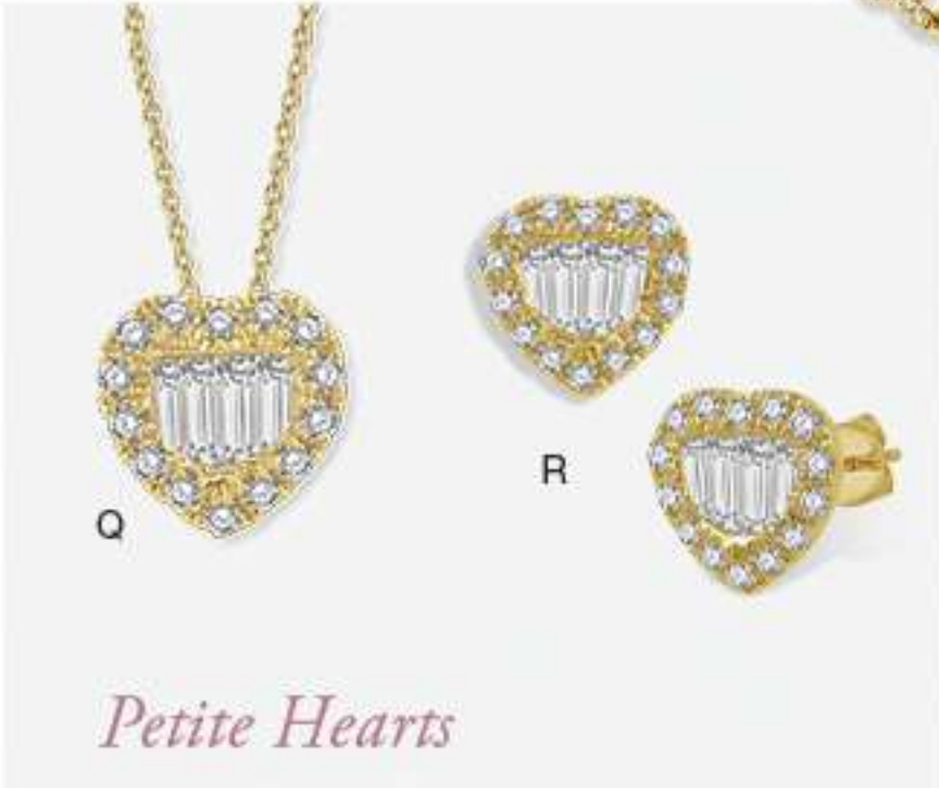
A. 1/4 carat tw paper clip necklace B. 1/10 carat tw paper clip ring C. 1/6 carat tw paper clip earrings D. 1 carat tw paper clip bracelet E. 1/10 carat tw paper clip necklace F. 1/3 carat tw paper clip earrings G. 1 carat tw paper clip bracelet H. 1/5 carat tw paper clip ring J. 1 carat tw curb link bracelet K. 1/6 carat tw curb link ring L. 1/3 carat tw curb link pendant M. 1/3 carat tw curb link hoop earrings N. 1/4 carat tw oval pendant P. 1/2 carat tw oval earrings Q. 1/5 carat tw heart pendant R. 3/8 carat tw heart earrings