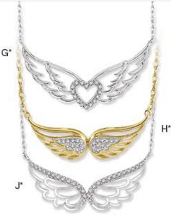
Angel Wing Necklaces