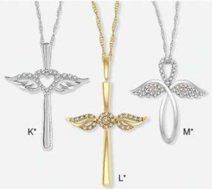
Angel Wing Crosses